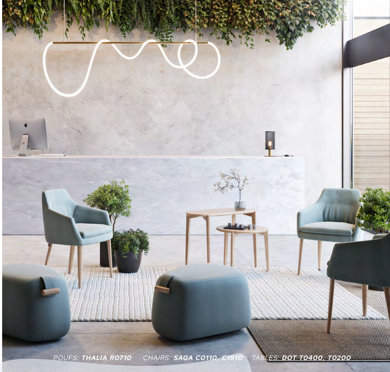
POUFS: THALIA R0710 CHAIRS: SAGA C0110, C1510 TABLES: DOT T0400, T0200

"Blue, the color that mirrors the sky and ocean brings tranquility and a sense of infinity, encouraging reflection within and around us."