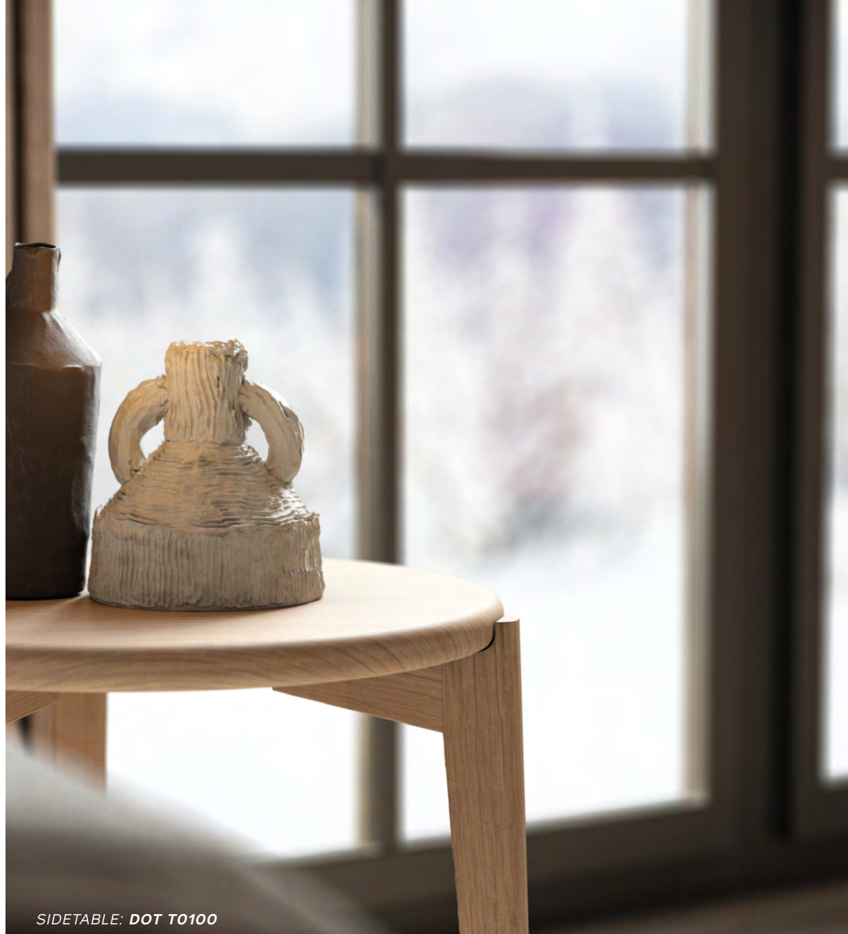
SIDETABLE: DOT T0100