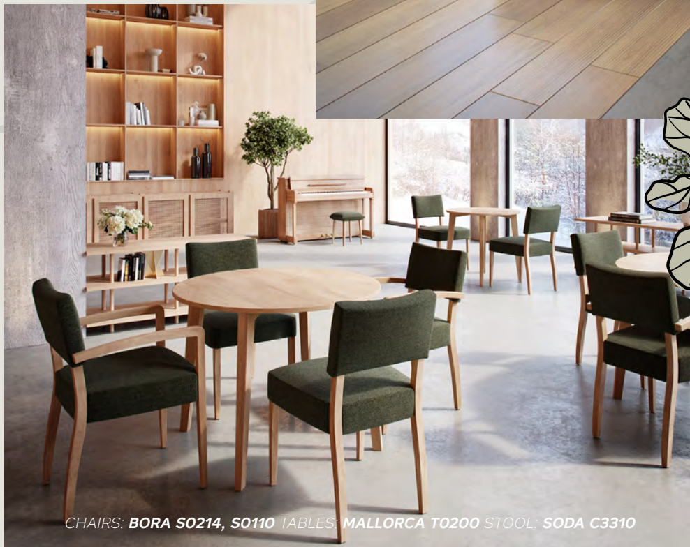
CHAIRS: BORA S0214, S0110 TABLES: MALLORCA T0200 STOOL: SODA C3310