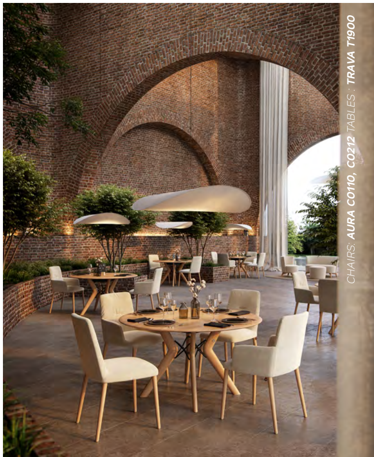
CHAIRS: AURA C0110, C0212 TABLES: TRAVA T1900