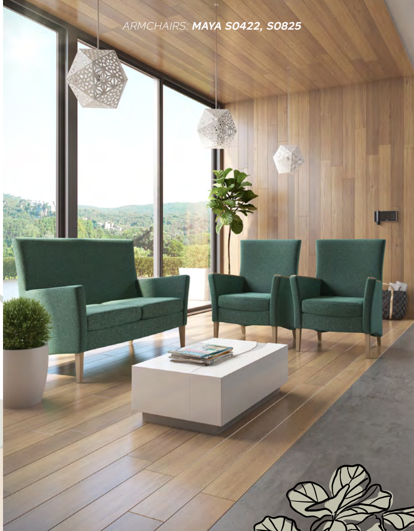
ARMCHAIRS: MAYA S0422, S0825