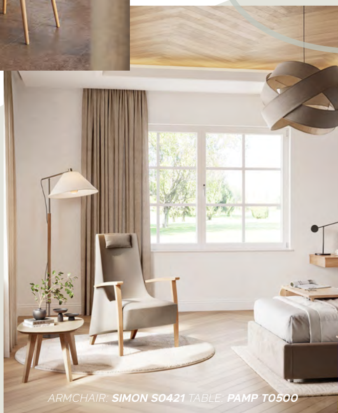
ARMCHAIR: SIMON S0421 TABLE: PAMP T0500