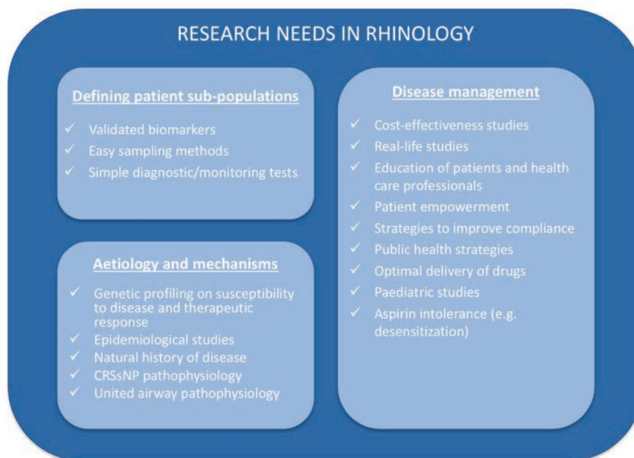
Figure 3. Research needs in rhinology.

into clinical practice is crucial but still little is done. Use of care pathways, modern technology and a patient-centered approach are most likely to change the management of upper airway diseases. Patient empowerment and self-management represent two major avenues for research. The ultimate goal of a cost-effective management will be well-being with nasal diseases.