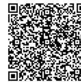
SNOT 22 & EPOS 2020 Criteria of Control