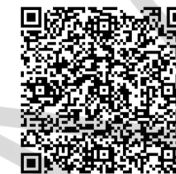
EUFOREA instructional videos for patients