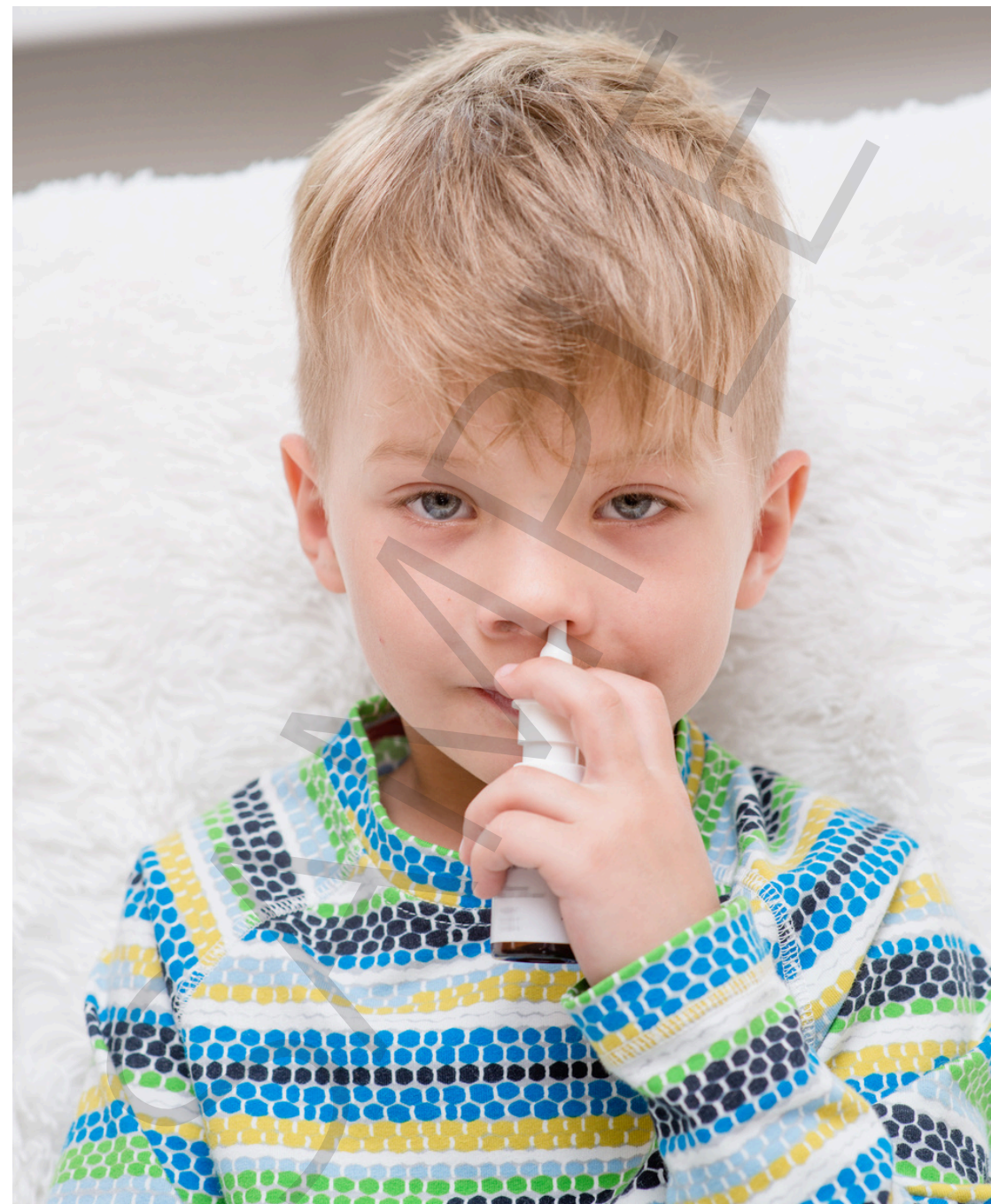
Spray technique: despite using the wrong hand the child is spraying correctly onto the lateral wall.